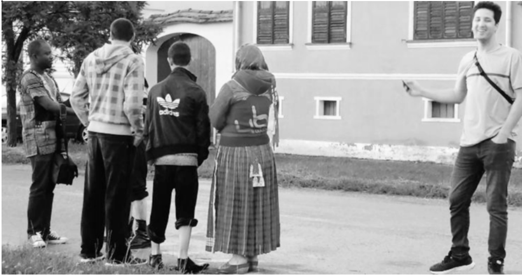
Fig. 6. Students

discussing with locals in Dealu Frumos. Source: M. Breiling, July 12th, 2018. Studenți discutând cu localnici în Dealu Frumos. Sursa: M. Breiling, 12 iulie, 2018.