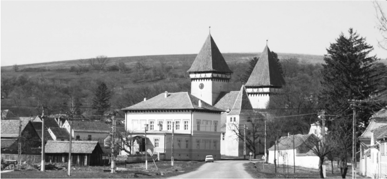
Fig. 4. Dealu Frumos/Schönberg Summer Campus of "Ion Mincu" University of Architecture and Urbanism, Bucharest. Campusul de vară al Universității de Arhitectură și Urbanism "Ion Mincu", București.