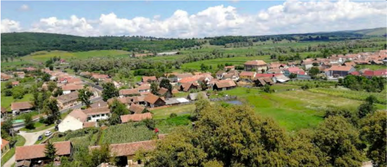
Fig. 5. View at Hosman/Holzmengen village from fortified church. Source: M. Breiling, July 11th, 2018. Vedere spre satul Hosman/Holzmengen dinspre biserică fortificată. Sursa: M. Breiling, 4 iulie, 2018.