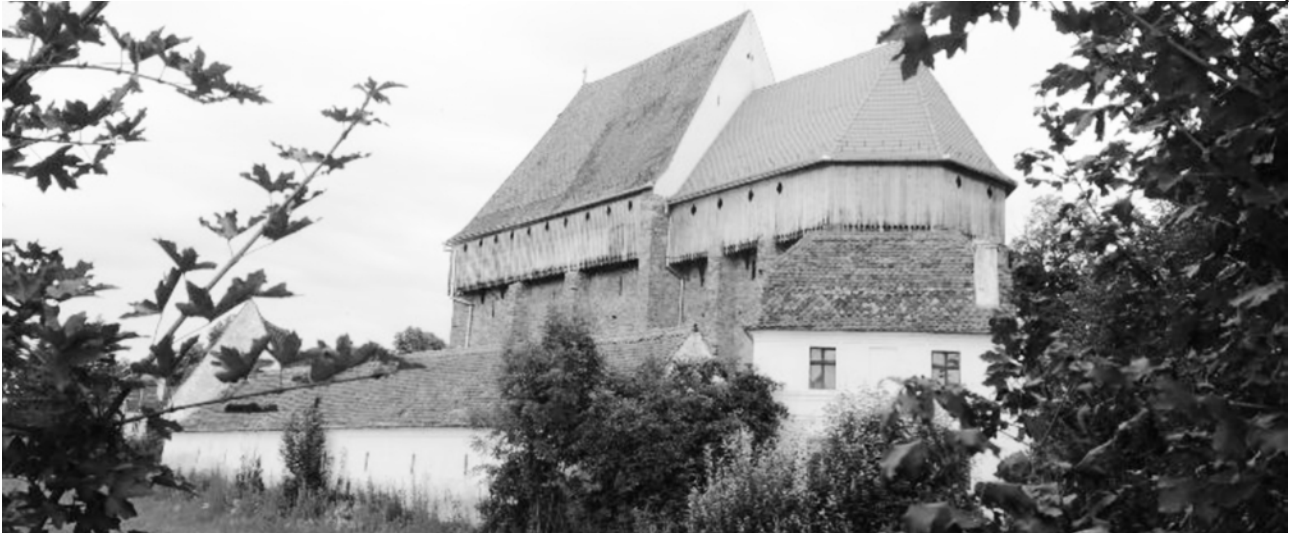
Fig. 2. One out of the many fortified churches built by Transylvanian Saxons in Brădeni/Henndorf . Source: M. Breiling, July 13th, 2018.

Una dintre multele biserici fortificate construite de către saxonii din Transilvania în Brădeni / Henndorf . Sursa: M. Breiling, 13 iulie, 2018.