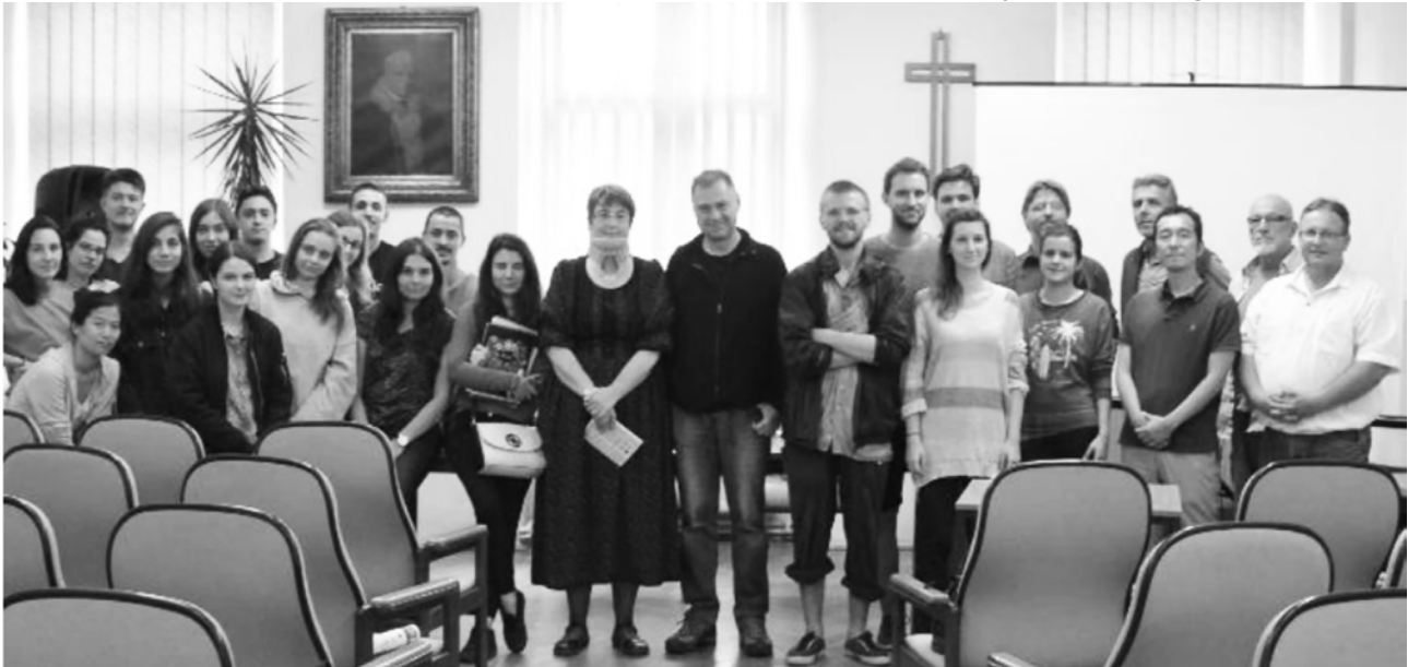
Fig. 3. Students and professors at Stiftung Kirchenburgen in Sibiu. Studenți și profesori la sediul

Una dintre multele biserici fortificate construite de către saxonii din Transilvania în Brădeni / Henndorf.