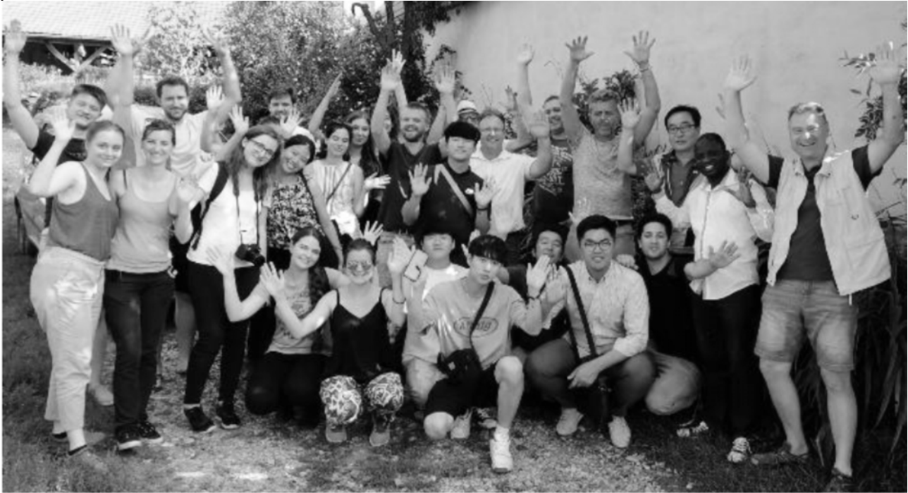
Fig. 1. Participants from the International Summer School Dealu Frumos/Schönberg 2018. Participanți la Școala Internațională de Vară Dealu Frumos / Schönberg 2018.